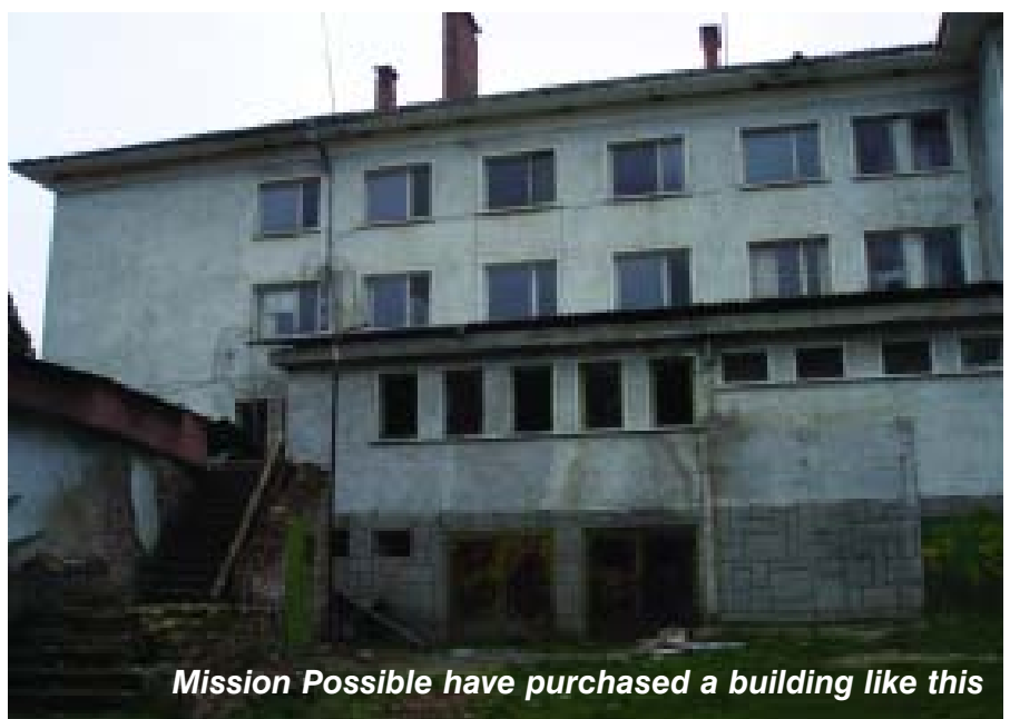
Mission Possible have purchased a building like this