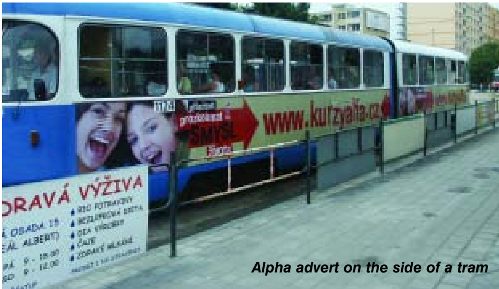
Alpha advert on the side of a tram

Over the past 10 years we have shared the vision of Alpha, provided the various books and manuals in each of the languages, set up national and regional Alpha Advisors, and trained nationals to run courses through the local churches. As a result we anticipate that in the coming year upwards of 1,000 courses will take place across Central and Eastern Europe.